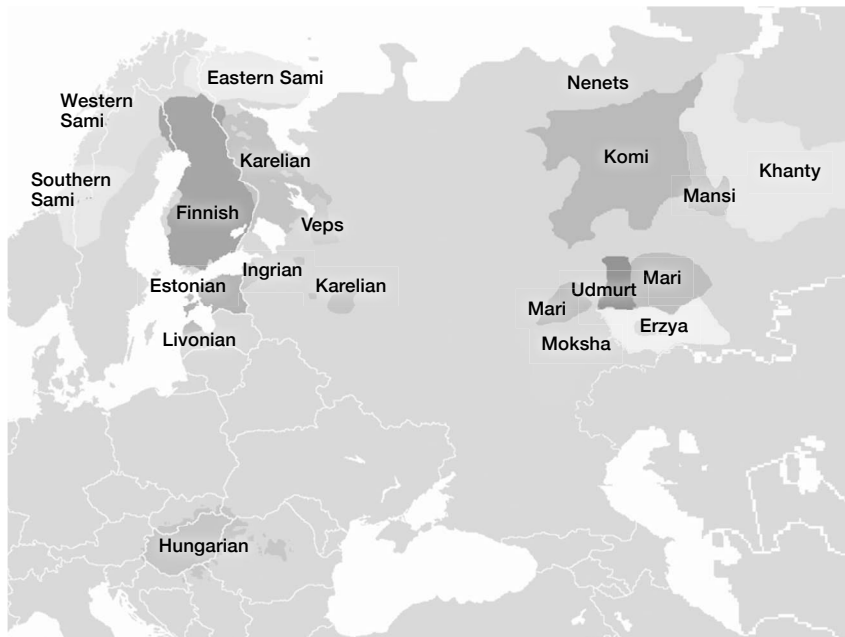
THE FINNO-UGRIC WORLD – A SOMEWHAT LONELY AND DISCONNECTED PLACE IF YOU STRAY TOO FAR FROM FINLAND AND ESTONIA.

a suffix; instead of saying ‘I have it’, they say something that could be rendered in English as ‘it is on me’. And finally, numerals are always followed by a singular (‘six dog’ rather than ‘six dogs’); if the number has been made explicit, why go to the extra trouble of modifying what follows?