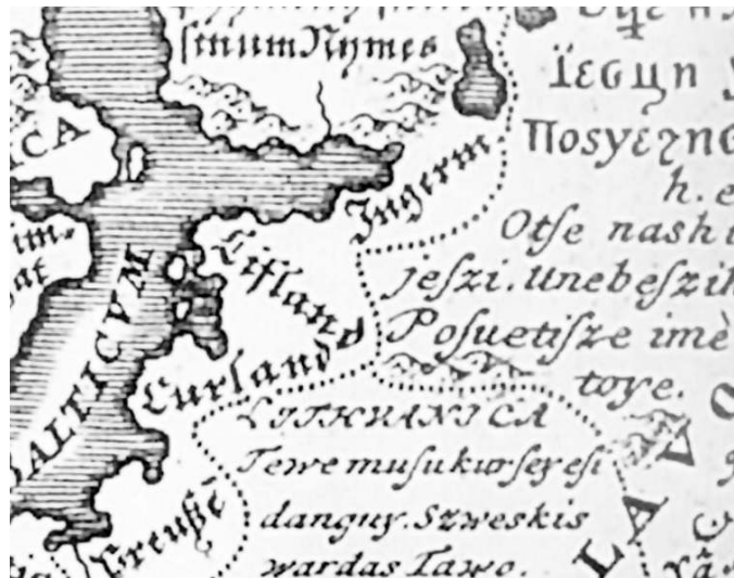
A MAP OF EUROPEAN LANGUAGES (1741) WITH THE FIRST LINES OF THE LORD'S PRAYER IN LITHUANIAN.

This kind of detective work has yielded a great deal of information. Unfortunately, though, the results are not greatly enlightening for non-linguists. 'Tongue', as it turns out, appears to have been *dn̥ǵʰwéh₂s in PIE. The asterisk here signifies that the word has been reconstructed on the basis of later languages. The other characters all represent a sound – but as to which sound, only specialists can tell (and, even for them, some sounds remain obscure). The result, in short, is rather abstract and not readily comprehensible.